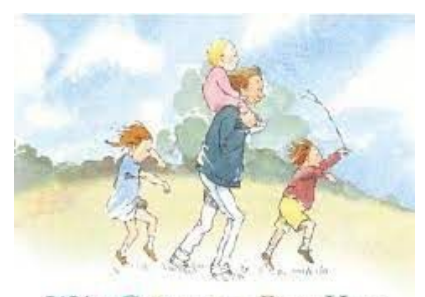
We're Going on a Bear Hunt

Children who will be starting reception in September will begin to access RWI. with some focusing on the pictures and others beginning or continuing to learn sounds.